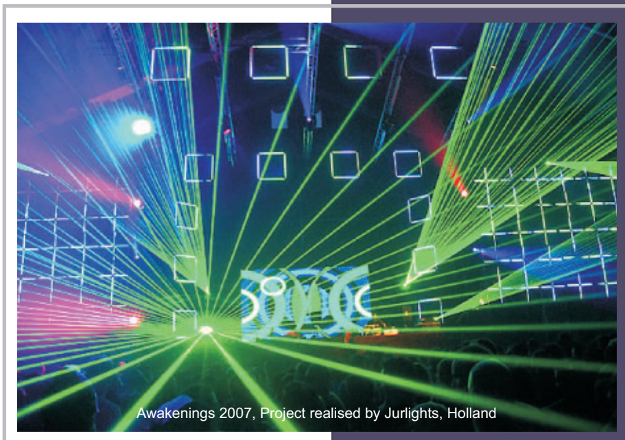
Awakenings 2007, Project realised by Jurlights, Holland