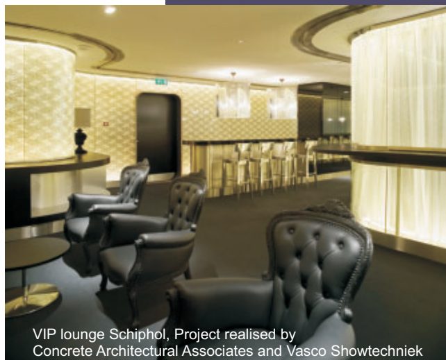
VIP lounge Schiphol, Project realised by Concrete Architectural Associates and Vasco Showtechniek