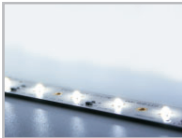
W4218 LED-board with 60° LED-chips in Neutral white colour